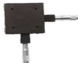
X-Y Testing table of Micro Vickers hardness tester Dim.:100×100 mm, Max. Travel Range: 25×25mm, Moving Resolution Ratio: 0.01mm

Double optical path design. Both eyepiece and CCD camera path can work at same time. No need switch optical path.