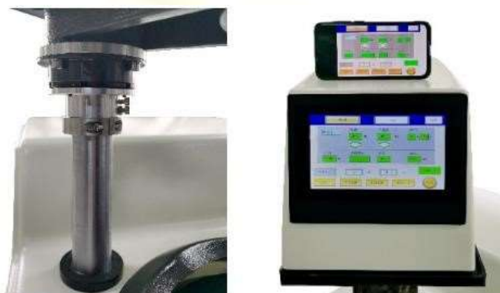
Electromagnetic automatic lock & remote